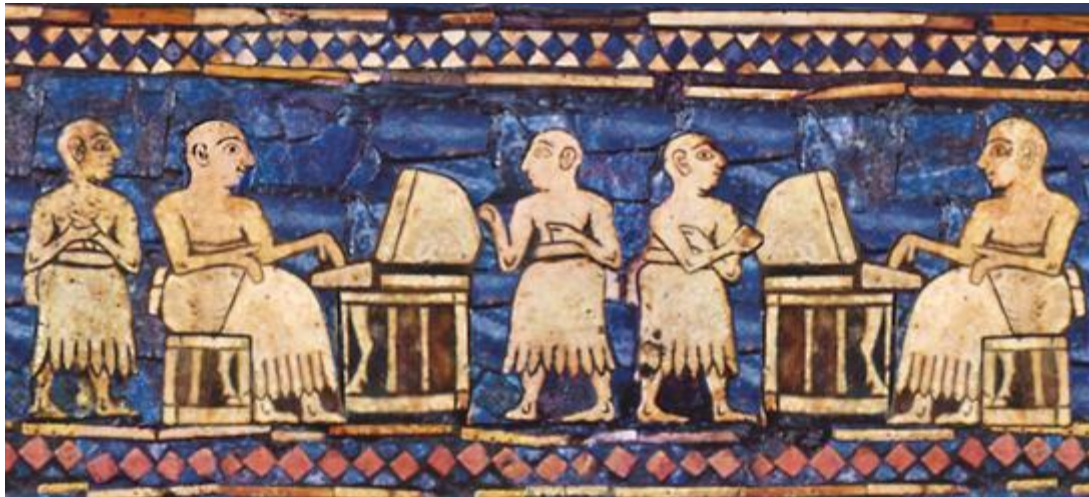
Part of King Shulgi's praise to the Sun god Utu Shamash as shown on http://www-etcs1.orient.ox.ac.uk