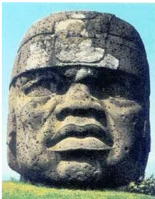
Mayan Olmec Head

The provided examples I & II are both evidently Time specific. Mayans also opined that Time as a concept was not linear but circular. This hypothesis/submission made this Writer - think, deduce and draw more conclusions which were reaffirmed once again in Mexico.