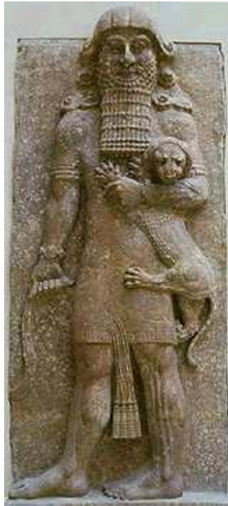
Marduk -A Sumerian/Babylonian god

This information was brought to the attention of a certain high profile personality of the International community through the British House of Parliament and a few international news agencies.