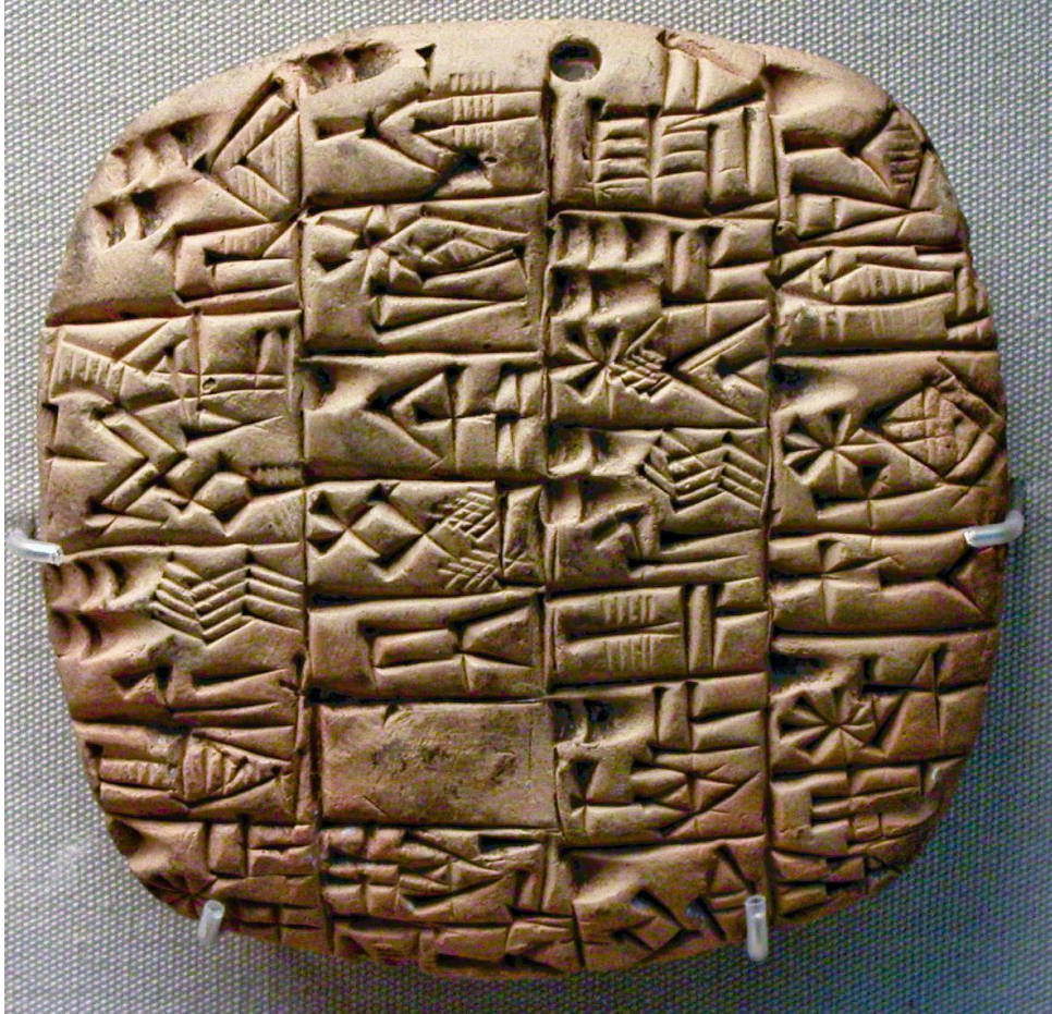
Akaddian/Sumerian Cuneiform textual writing on baked clay tablet

Back to the bone of contention, another monumental once-in-a lifetime discovery but this time about the connection between English language, ancient Sumerian/Babylonian text – its gods/deities, myths, religion, tradition and culture. And yes, how in present contemporary time it yielded its secrets, managed to get decoded and made publicly known.